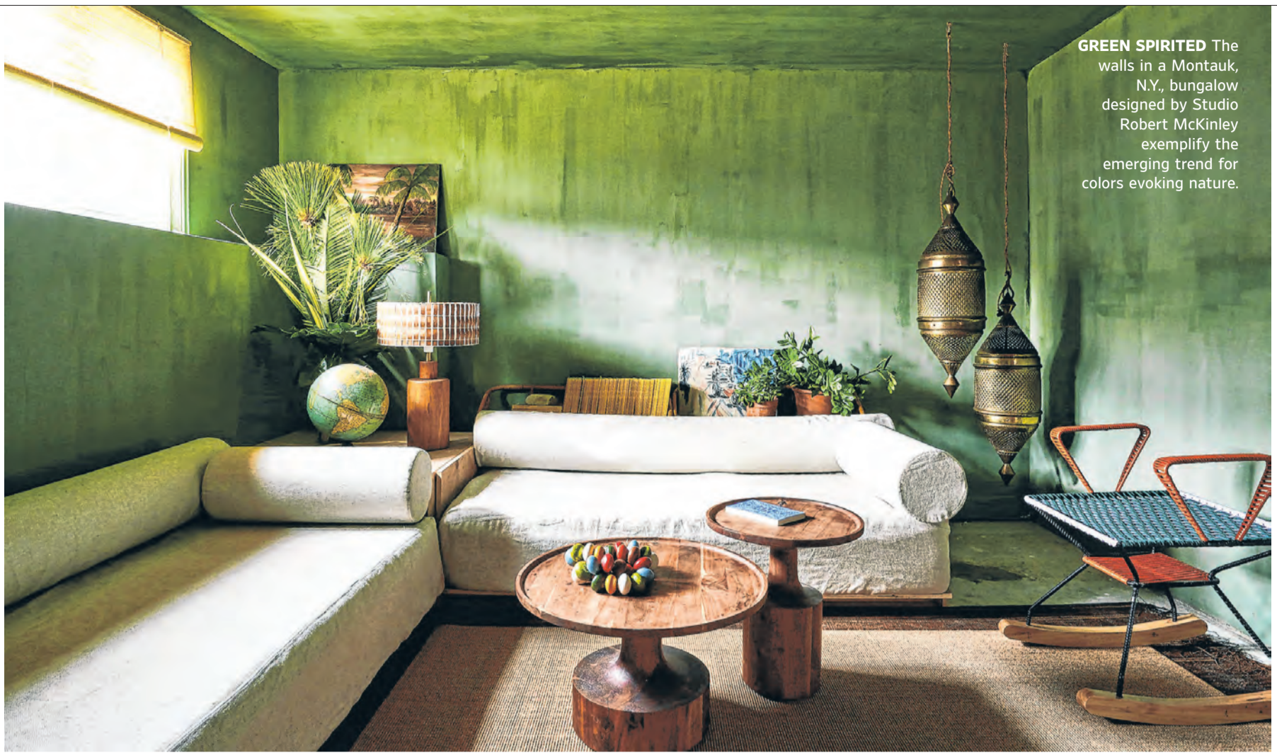
GREEN SPIRITED The walls in a Montauk, N.Y., bungalow designed by Studio Robert McKinley exemplify the emerging trend for colors evoking nature.